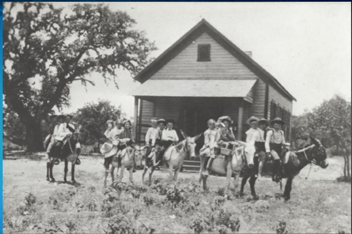
Texas school hous after the Civil War